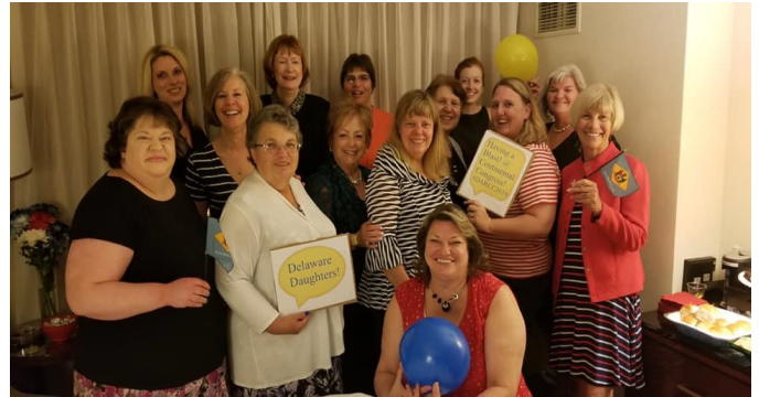
Delaware Daughters Cocktail Party