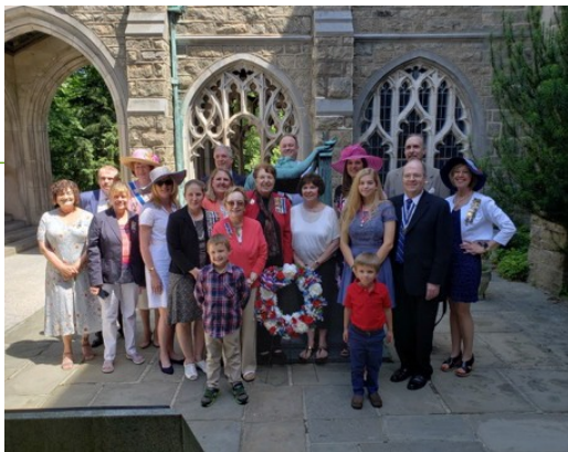
DAR, SAR, and CAR at the Valley Forge Memorial Chapel in June 2019