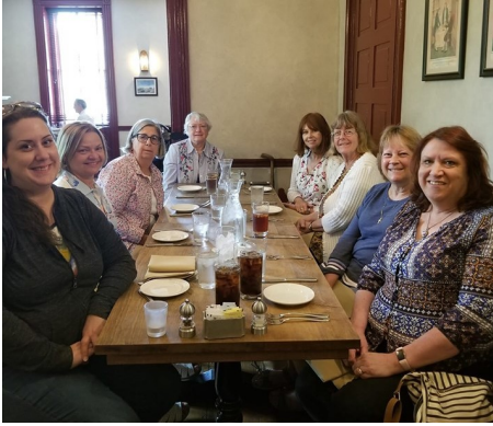
The daughters of Col. John Haslet Chapter enjoy lunch at Cantwell's Tavern in Odessa after their tour of the Hale-Byrnes House near Stanton

Many members attended the Spring Conference, where one of our own became the State Librarian. New Chapter officers were inducted at the May meeting.