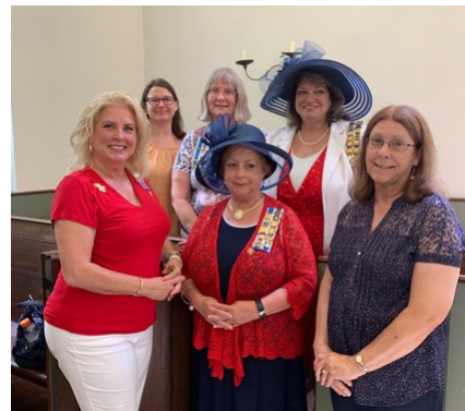
The Daughters of Cooch's Bridge and Caesar Rodney at the "Ringing of the Bells" in New Castle for 4 th of July.