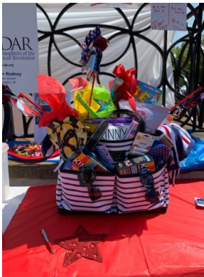
Patriotic Beach Basket made by Caesar Rodney Members as a fundraiser.

April found our chapter with a booth participating in "A Day in Old New Castle." We had many members help donate to and create a patriotic/beach basket which we raffled off with an ice cream maker. We had fun interacting with the public and spoke with 12 women who expressed interest in joining DAR.