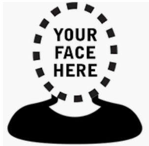
Open Organizing Secretary