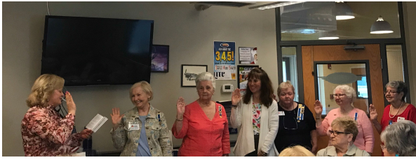
Installation of the Officers of the Major Nathaniel Mitchell Chapter