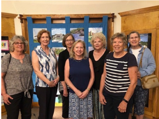
Members of Col. David Hall Chapter visit the Seaford History Museum.

We also worked as docents at the Rehoboth Art League Cottage Tour which is the art league's major fundraiser.