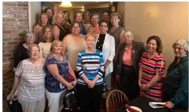
The June Brunch at The David Finney Inn in Historic New Castle

We continue to proudly support with time and donations many local and state organizations like the SAR, CAR, Elsmere VA Hospital, Read Aloud DE and other church and local civic commitments. Our Chapter had a great year and is enthusiastically anticipating the next!