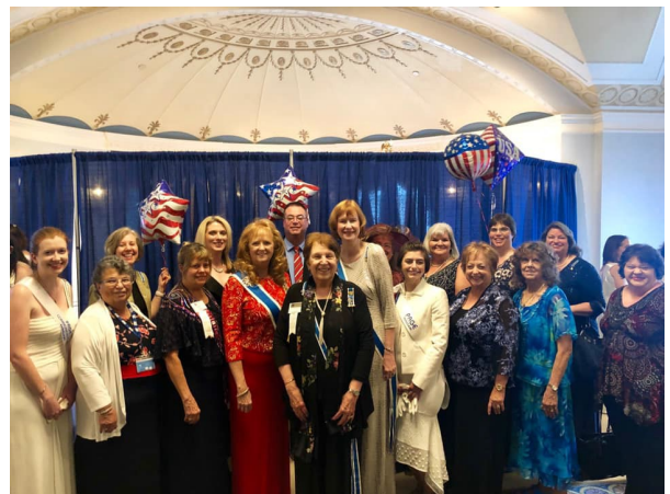
The Delaware Daughters in evening attire at National Defense Night June 29, 2019