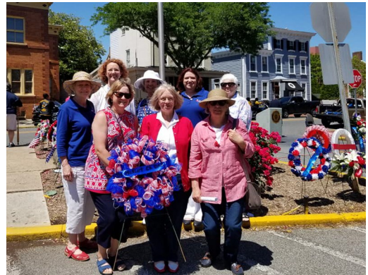
Members of Col. Haslet with their patriotic red, white and blue wreath for a wreath laying ceremony