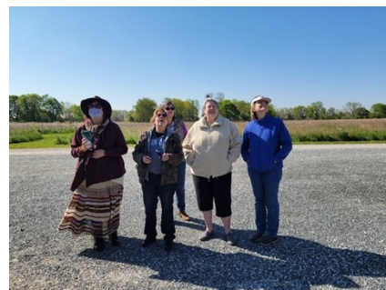
Cooch's Bridge Bird Watchers

Merlin is easy to use. Since you are using a smart phone, Merlin knows the location of your sighting! First, you would select the