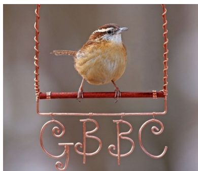
Carolina Wren

data, thus dramatically increasing the volume of data that can be collected and analyzed. For example, when invasive lady bug eggs were sold to unsuspecting gardeners, local ladybug species were dramatically reduced. Children and adults helped collect data, identifying native ladybugs by counting their (nine) spots. Thus, the plight of the nine-spotted ladybug was soon well known, and the influx of nonnative ladybug species was halted.