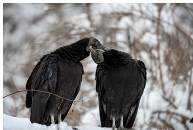
Black Vultures

One tool used to understand species that are threatened is citizen science. Citizen science encourages all of us to collect