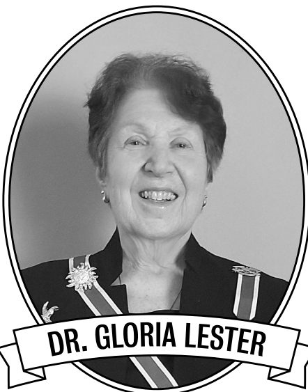
Delaware State Regent 2019 - 2022

STATE THEME Renew, rise up, reach out and help. You can make a difference in the lives of others by serving America.