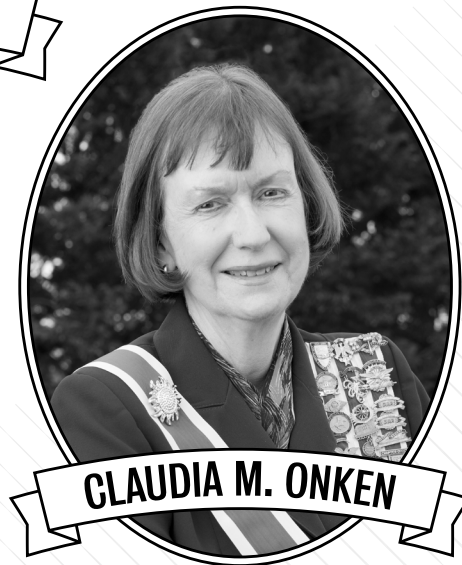
Vice President General 2017 - 2020 Honorary State Regent 2013 - 2016