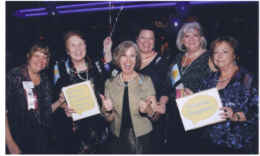
Delaware Daughters Representing! Continental Congress 2019