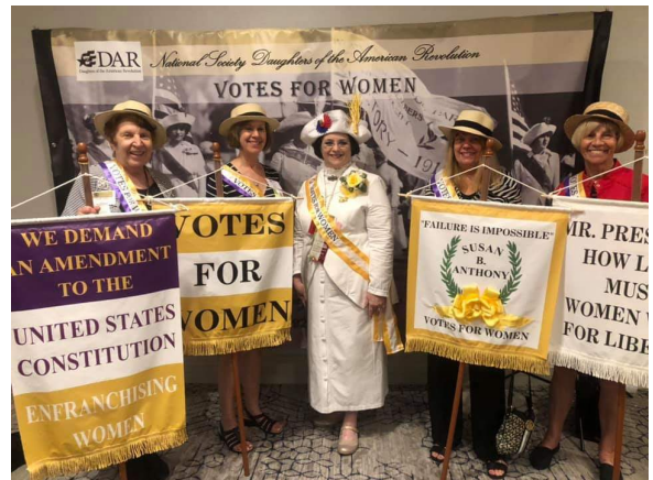
Votes for Women! Continental Congress 2019